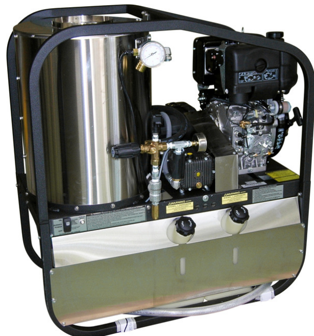
SW800 Bare unit

Fuel Storage: 3 L Petrol and 60 L Diesel